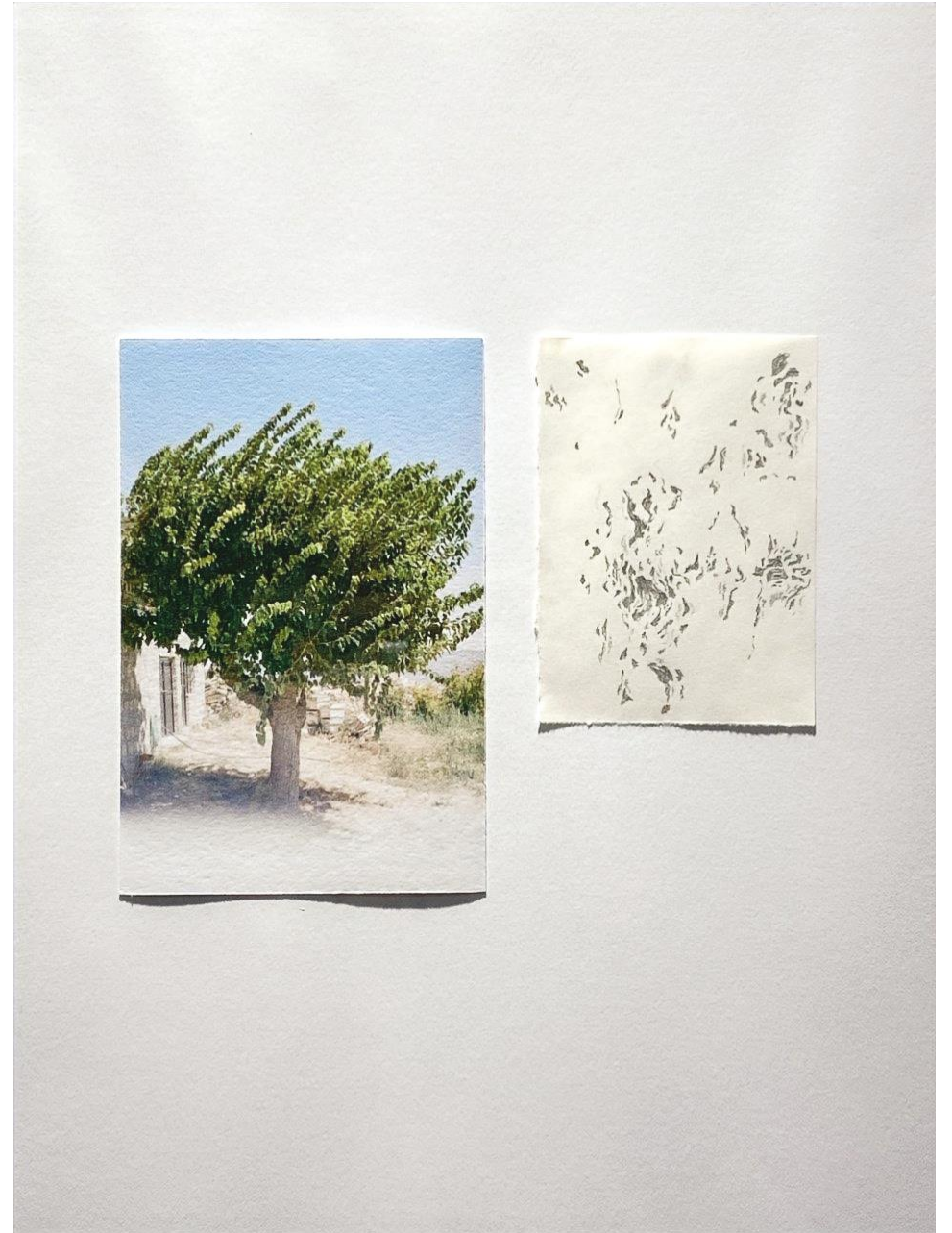
'the house with the mulberry tree' 2024 photography and pencil on paper 15 × 20 cm