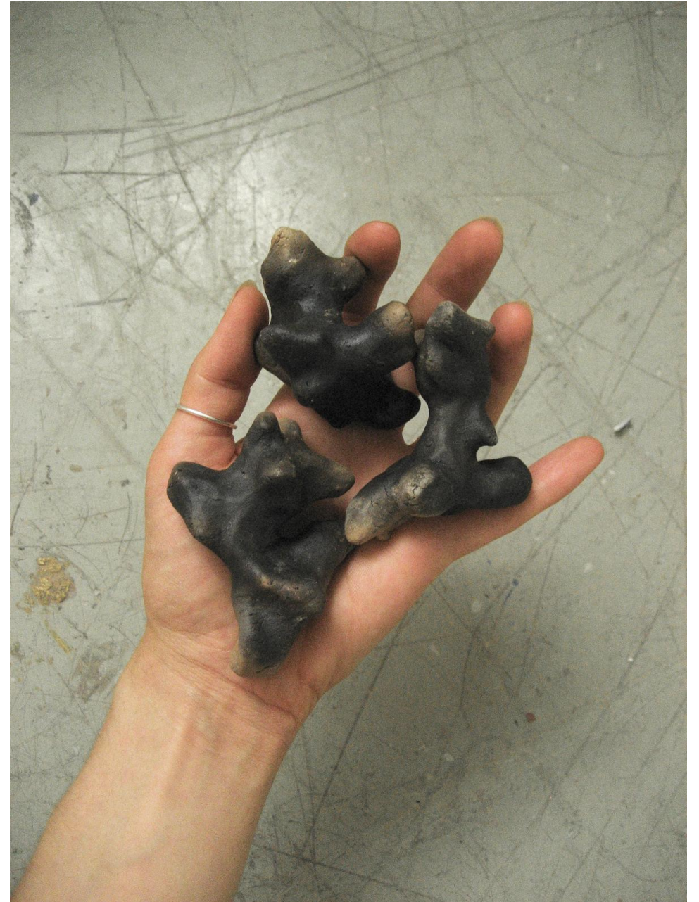
details of the unglazed raku ceramic sculptures