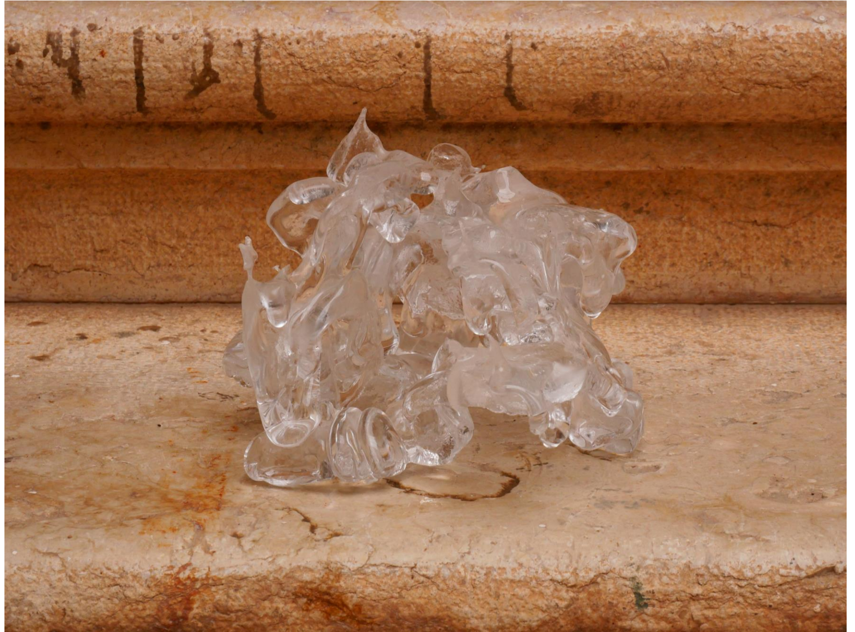
untitled 2024 glass