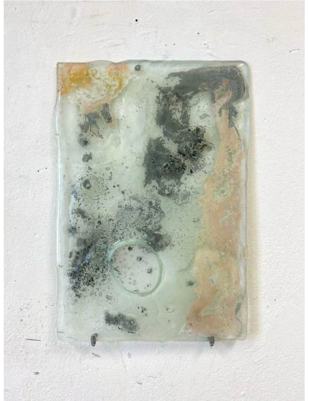
untitled 2024 glass and wood stain 33 × 23 cm