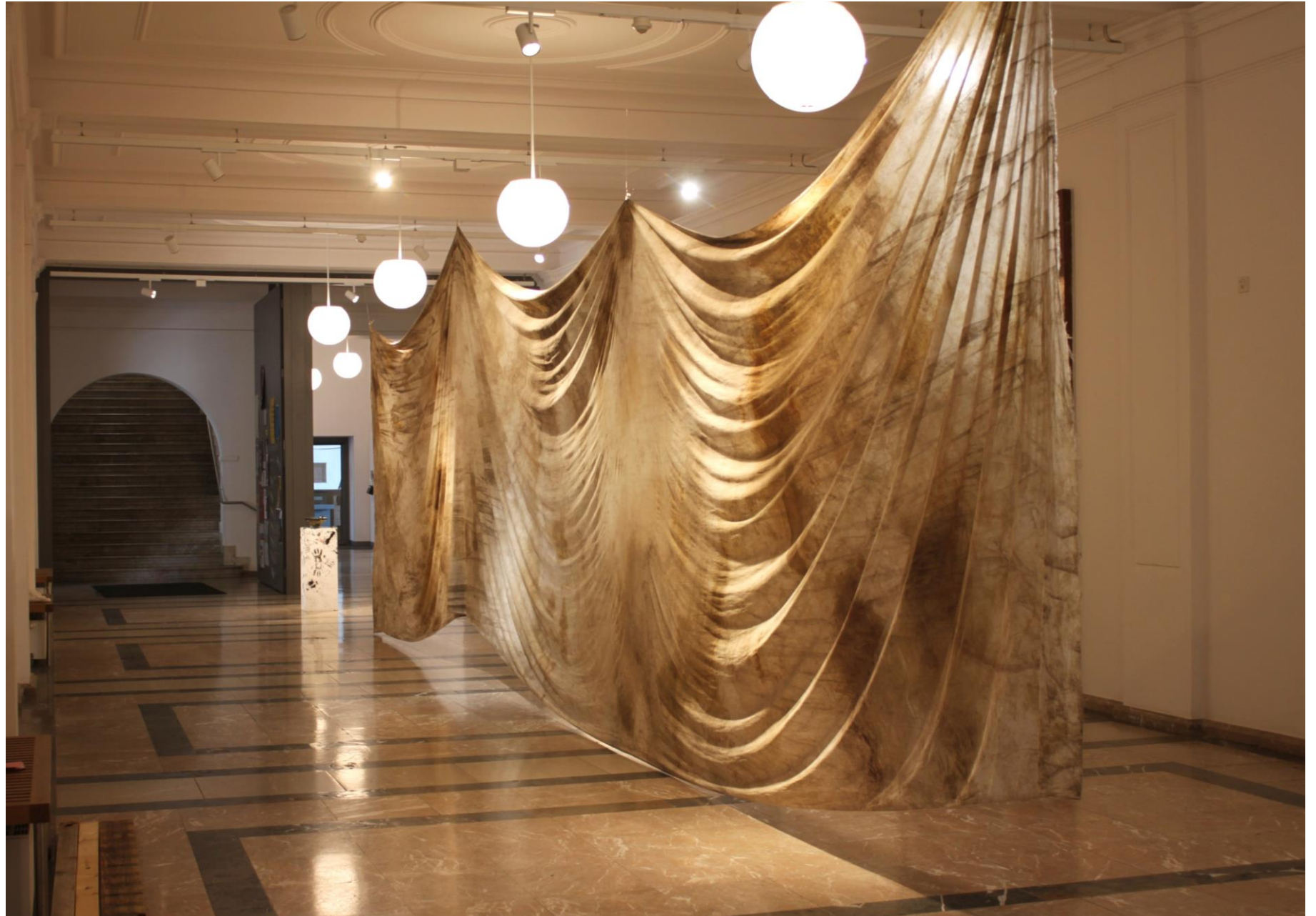
2022 natural pigments and flavors (austria) on fabric 3 × 12 m